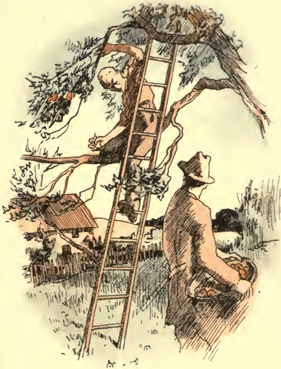
He mounted the ladder and began to pick the fruit See page 44